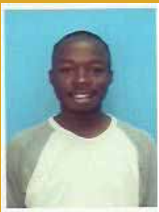
Kenyan HYTES student

I am the only child my parents passed away when I was small. I know stay with my aunt who acts like my parents .she is a single mother and her daughter is in class eight though she don't have a good job, she try and puts food on the table.